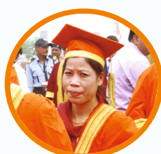
Mrs. Mary Kom Boxer Recipients of Honoris Causa, 4th Convocation