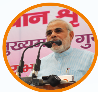
Shri Narendra Modi Hon'ble Prime Minister of India on National Lecture Series "Naxalite Problem in India"