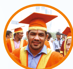
Shri Sushil Kumar Wrestler Recipients of Honoris Causa, 4th Convocation