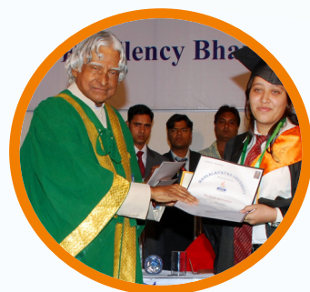
Shri A.P.J. Abdul Kalam Former President of India Chief Guest, 2nd Convocation