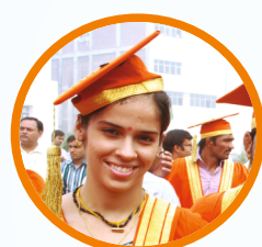
Ms. Saina Nehwal Badminton Player Recipients of Honoris Causa, 4th Convocation